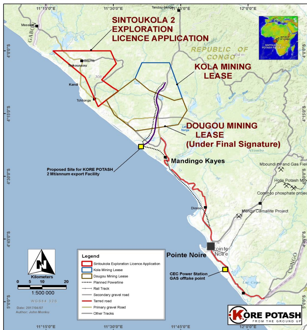
Figure 1. Map showing the location of the new Sintoukola 2 Exploration License application