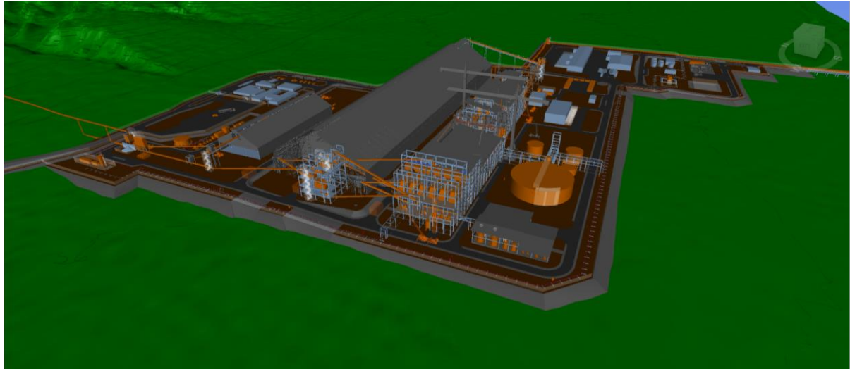
Figure 1: Process plant area model