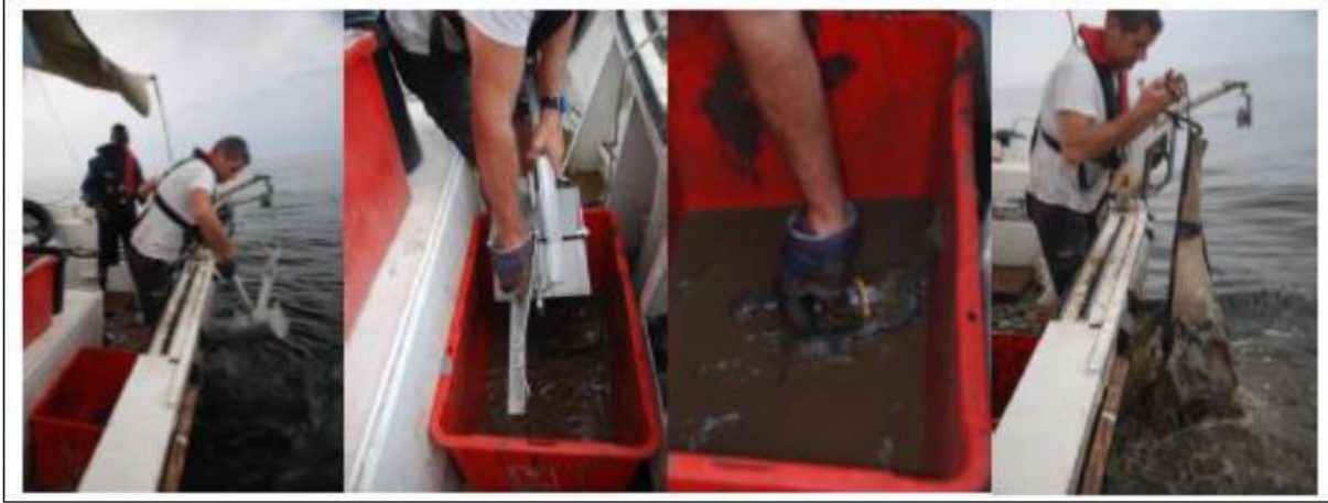
Figure 3: Water sample collection at Tchiboula and near the transshipment zone